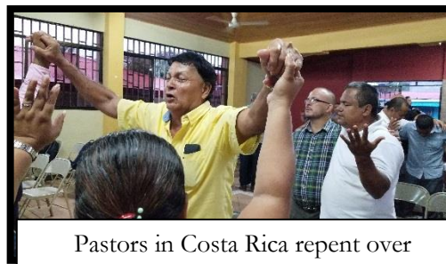
Pastors in Costa Rica repent over past disunity and pray for each other