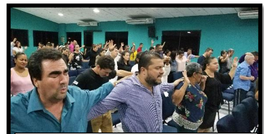
Citywide prayer gathering for the region of Ciudad Neily, Costa Rica