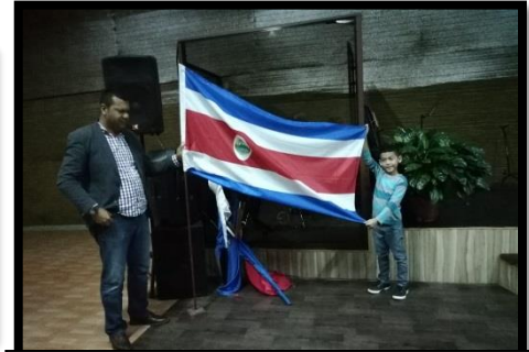
Pastors conference and citywide meeting in Perez Zeldon, Costa Rica