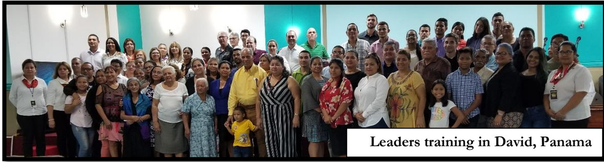
Leaders training in David, Panama

"But I will stay on at Ephesus until Pentecost, because a great door for effective work has opened to me, and there are many who oppose me." 1 Corinthians 16:8-9