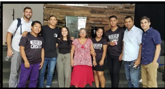
Through some of those we met we are seeing the possibility of forming a network specifically for youth & young adults across Latin America