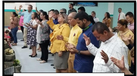
Leaders training in David, Panama

We had the privilege of traveling to four cities across Panama and Costa Rica. In each location God graciously moved on the hearts of the men, women and youth who had gathered to be trained in reaching their cities with the good news of Jesus Christ.