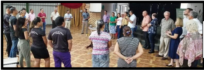
Leaders training in Puntarenas, Costa Rica