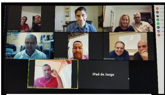
Screenshot of our first video conference call for Latin America

Now we have the opportunity to steward something much bigger than ourselves. We recently purchased access to a video conferencing system that will allow us to host group video calls with as many as a hundred participants from across Latin America. We have also used the technology on phones in order to create a real-time community group made up of the key leaders that we were able to connect with. We are seeking to send all 132 people copies of the Spirit Empowered Life book, hosting a real-time conversation in the community group and setting up regular video calls to be able to interact face-to-face.