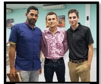
Connecting with pastors in Panama

Our prayer request before leaving for the trip was that God would identify “people of peace” (Luke 10:6) to us and it was simply amazing to watch Him do this. We would enter into a new city not knowing anyone and by the time we would leave (sometimes in less than 24 hours) He would have clearly identified between 2 to 5 people who were the key “people of peace” that we were to continue to work with in that area. By the end of our journey we had 132 people who had signed up to be mentored in city transformation and/or to participate in the 40 Days of Love in 2020.